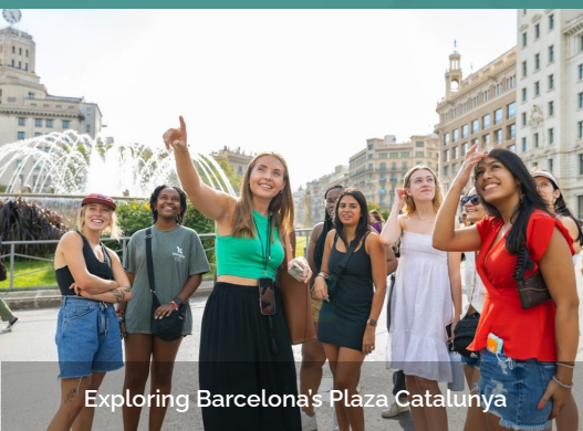
Exploring Barcelona's Plaza Catalunya