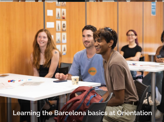
Learning the Barcelona basics at Orientation

“Our partnership with Barcelona SAE has truly benefited our students. I am always assured that my students are looked after. What more can you ask for in an organization?”