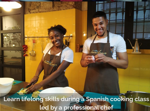
Learn lifelong skills during a Spanish cooking class led by a professional chef