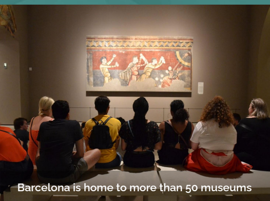
Barcelona is home to more than 50 museums