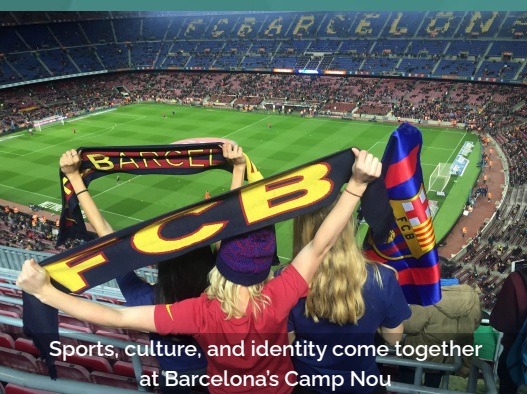
Sports, culture, and identity come together at Barcelona's Camp Nou